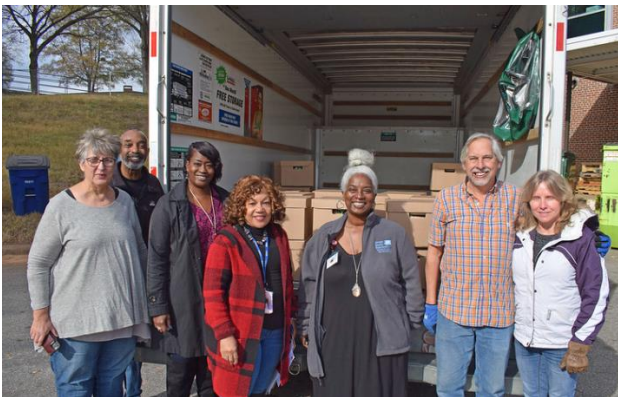
Thank you to Winston-Salem First Church and RestoreOne who donated 50 Thanksgiving meals to Social Services clients!